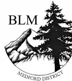
Table Rocks Curriculum Food Web Freeze Tag

Objective: Students will identify predator/prey relationships by playing a game of tag. Students will discover how organisms interact with their environment and will create a food chain and a food web .